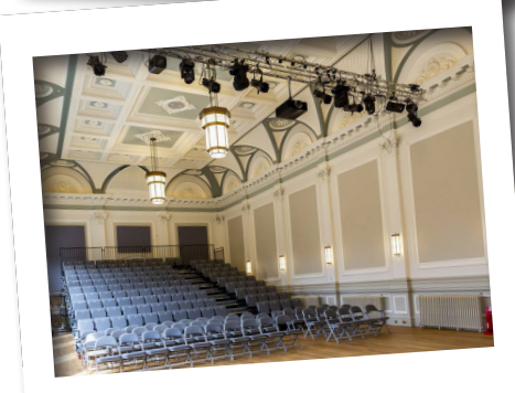
Skipton Town Hall High Street, Skipton, BD23 1AH