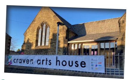
Craven Arts House 55 Otley Street, Skipton, BD23 1ET